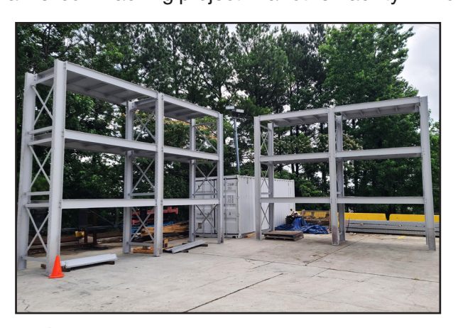
Steel Coil Storage Areas

About Phoenix Metals: Phoenix Metals was founded in 1980 and is a leading metals service center in North America. Phoenix Metals is committed to offering customers unsurpassed quality and service with metal products cut to specification.